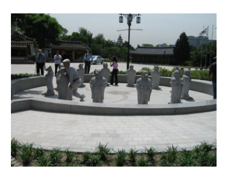
Visiting the Korean Zodiac