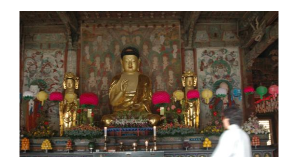
Inside The Main Hall