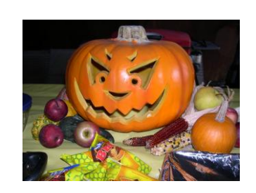
What a nice Halloween pumpkin!