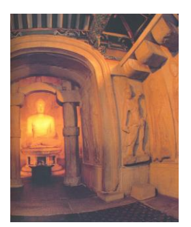
The First Sunlight shines on Buddha.

This large rock called Taewantam (Great King's Rock), submerged in the East Sea, is known as the underwater mausoleum of Silla's King Munmu, who unified the Korean army of Tang China in 676. The king died in 680 and his body was cremated. This granite rock on the sea is said to have been the place where his remains were preserved in accordance with the will of the king. The tomb, 20 meters away from the shore, is known as the world's only undersea mausoleum. It is interesting that every morning when the sun rises, sunlight is radiated by the diamond on the Buddha's forehead to the water where the tomb lies. It is said the tomb is protected. In addition, Avalokitesvara and smiling Buddhas are the added attractions. Buddhist followers believe that by visiting all these shrines they could feel eternal peace.