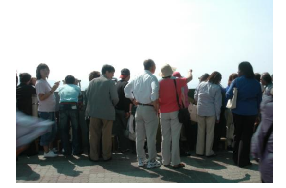
GASI members at DMZ DMZ provides testimony to Korea's recent past