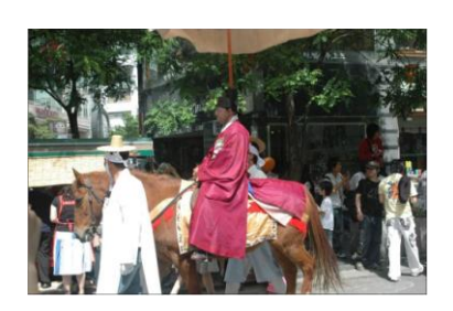
Observing Traditional Korean Wedding