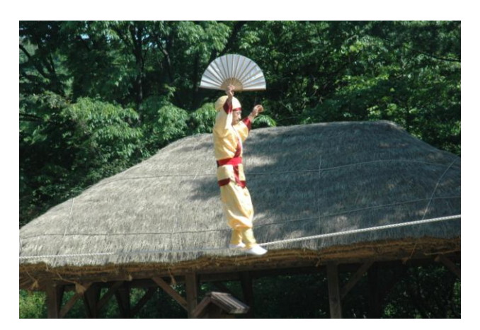
Watching the Rope Walking