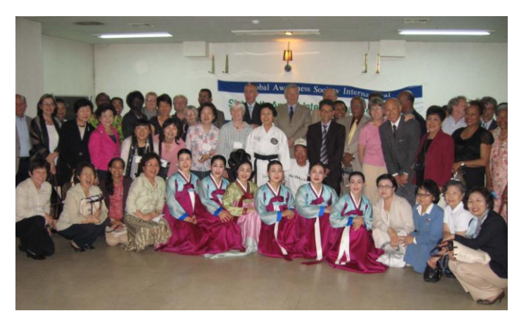
GASI members with performers in Seoul, Korea

Keynote speakers with Korean representatives