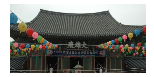
The Main Hall

Sokkuram Grotto, situated higher up on Mt. Tohamsan, is the No. 24 National treasure. The temple was constructed in 751 as a worship place to pray for national prosperity, reincarnation of royal family and realization of one's wishes. It is believed that visiting this temple and praying can fulfill his or her wishes.