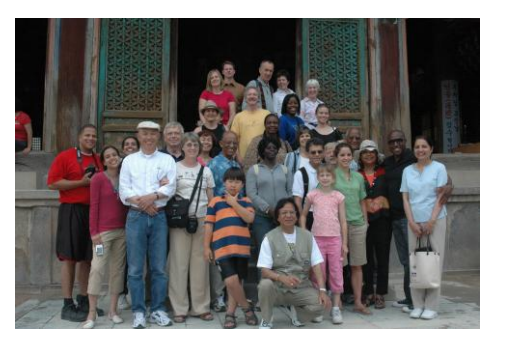
The GASI Group after Crossing the Gate of Heaven

This Gate was newly built in1973 during the restoration of the temple. The architectural style of this gate is modeled on that of the Choson period (1392~1910). The gate is known as the biggest of the extant gates of its kind in the nation.