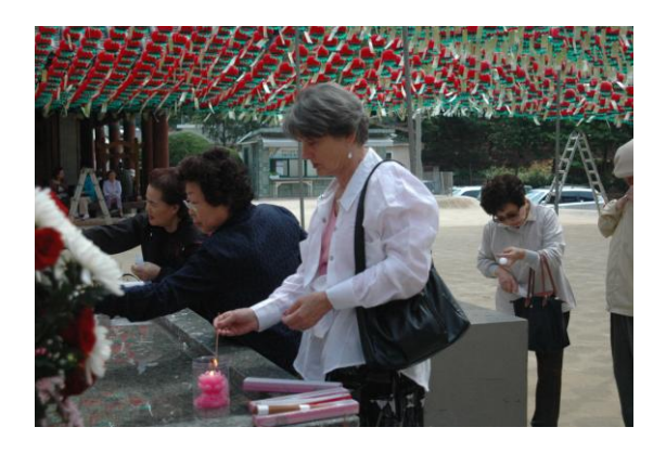
Lighting the Spiritual Candle