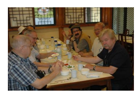
Enjoying Korean Cuisine